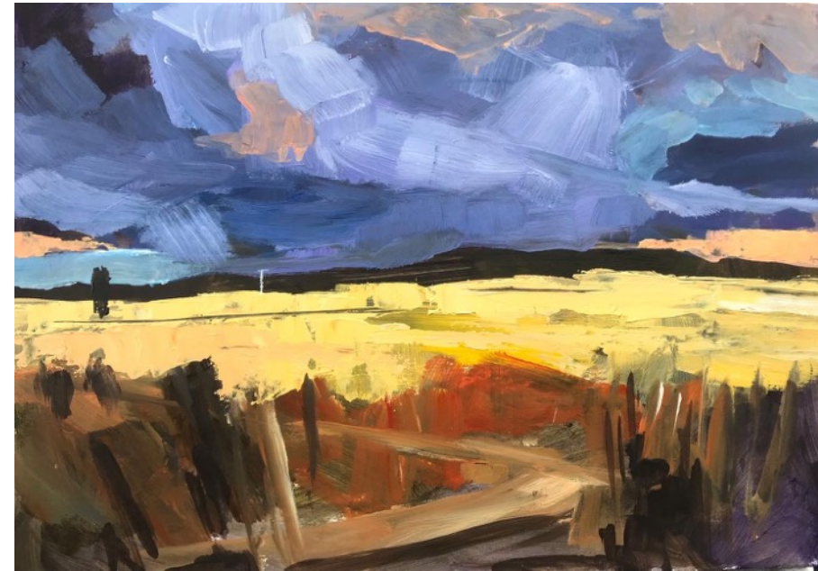
Fields Of Gold Acrylic on paper 50 x 60cms $850