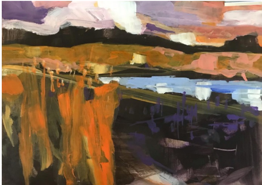
Look Around You Acrylic on paper 50 x 60cms $850