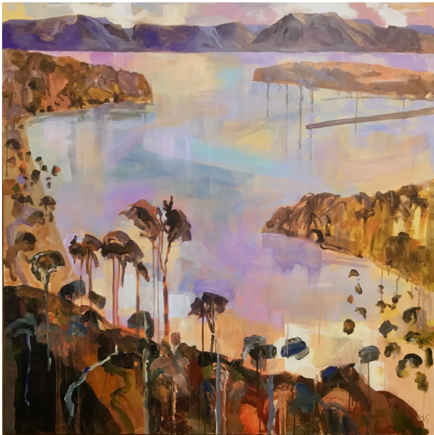
Hazy Shade Of Pale Acrylic on board 123 x 123cms $4,650