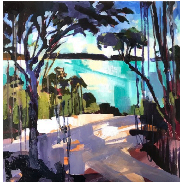
Shadowplay Acrylic on board 43 x 43cms $1,250