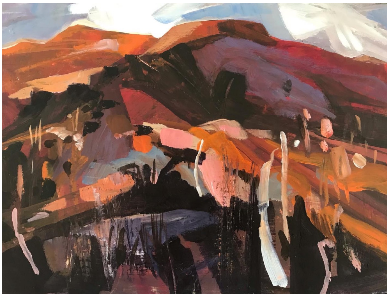
Soft Breathing Acrylic on board 33 x 43cms $1,100