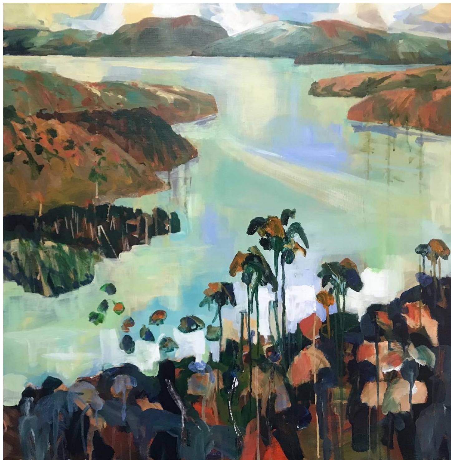
Start Of Day Acrylic on board 83 x 83cms $2,850