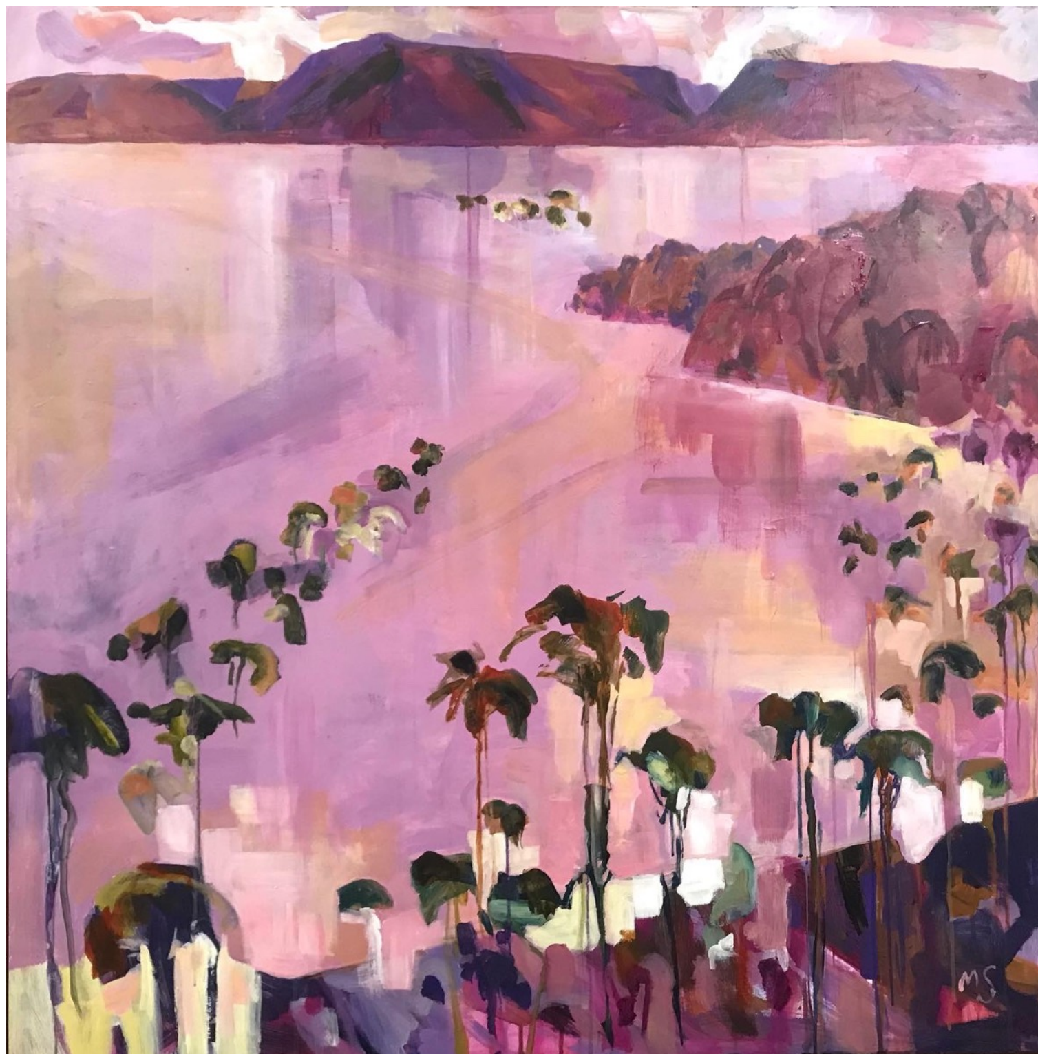
Summer Pinks Acrylic on board 123 x 123cms $4,650