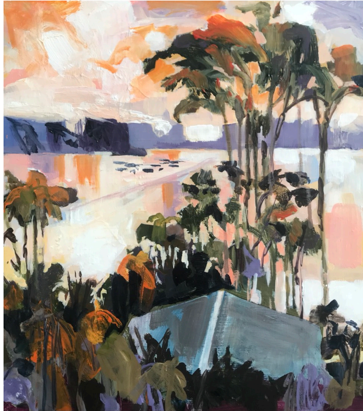
Remember Me Acrylic on board 43 x 53cms $1,400