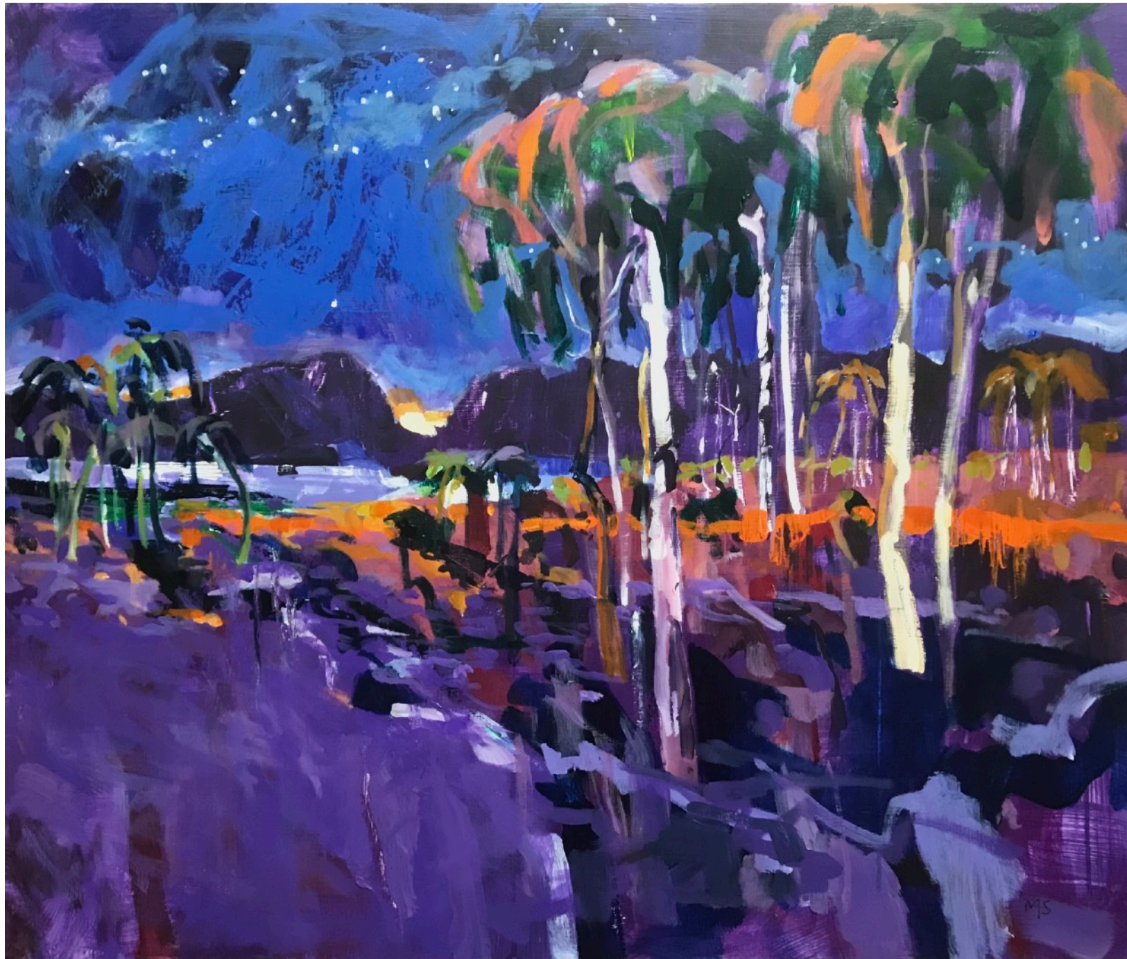
Beneath A Southern Sky Acrylic on board 84 x 100cms $3,250