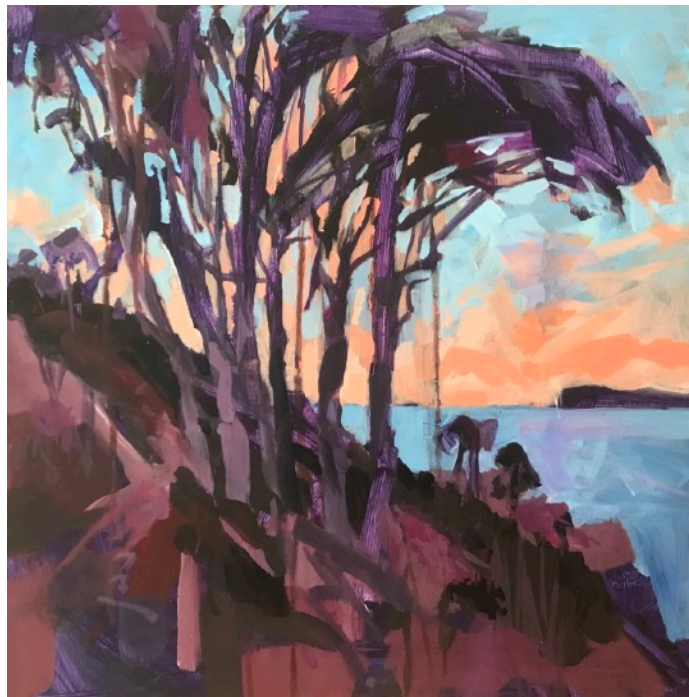
Time Weaves On Acrylic on board 43 x 43cms $1,250