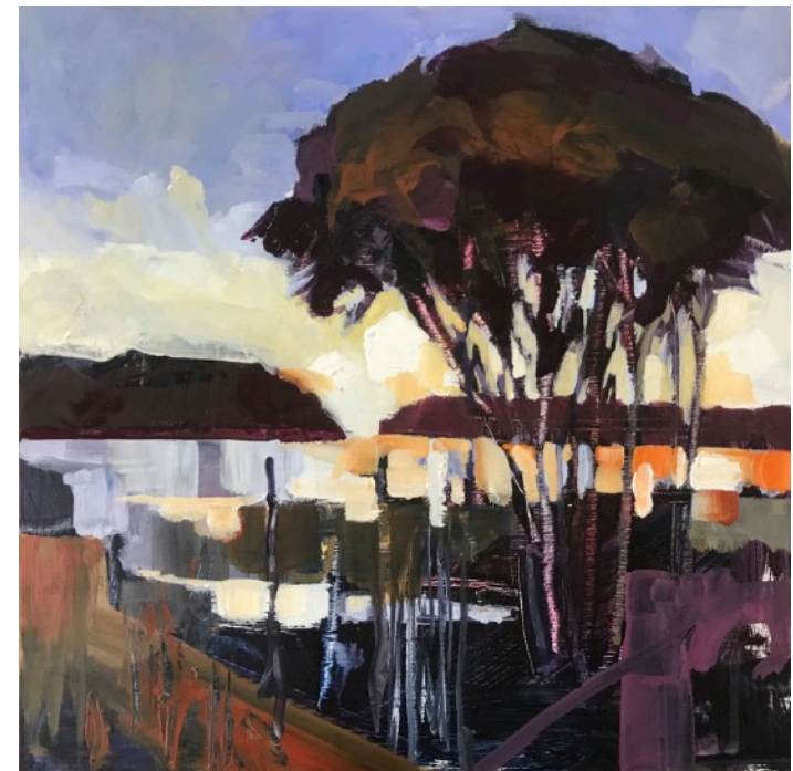
The Water's Edge Acrylic on board 43 x 43cms $1,250