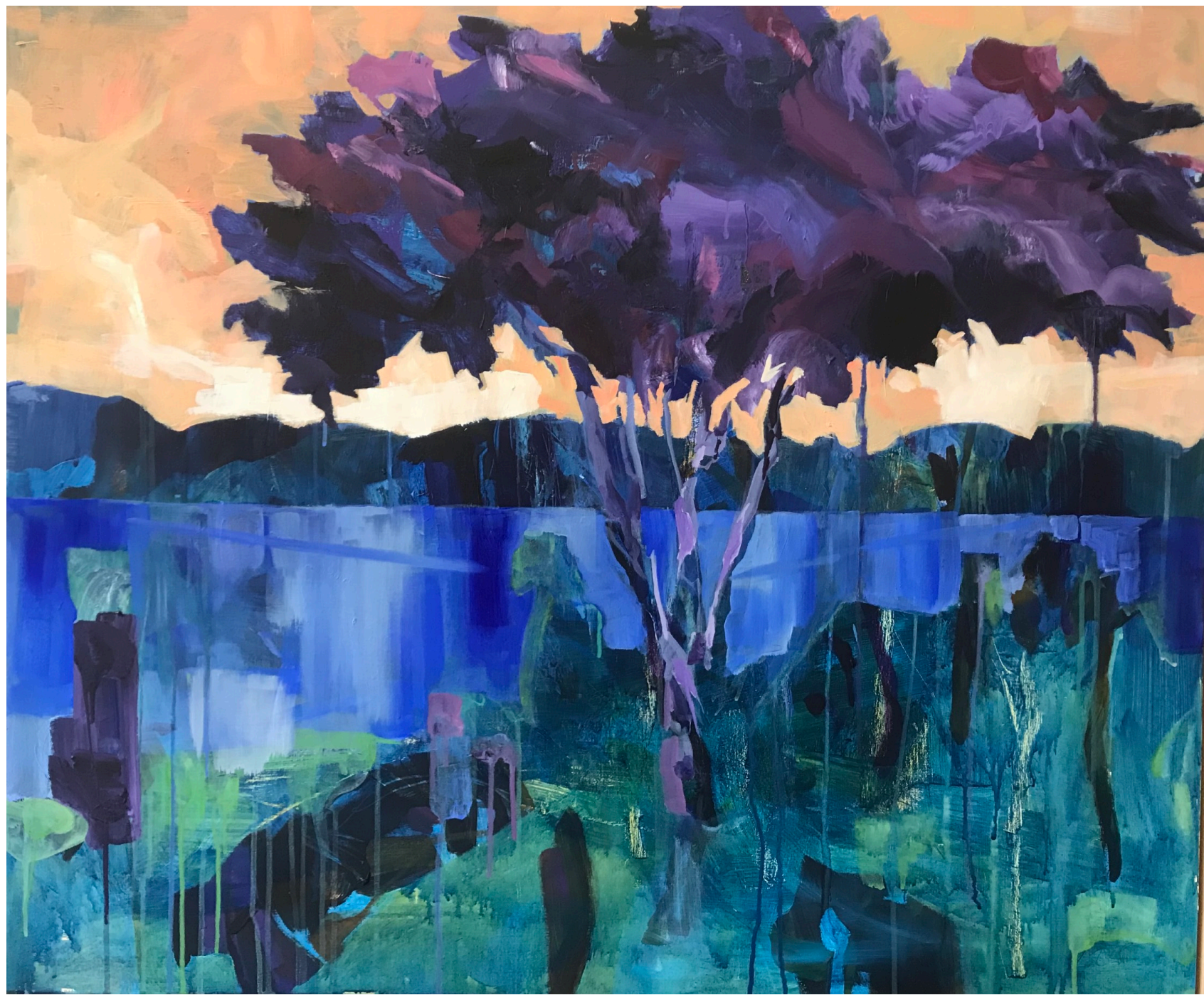
Awaken Acrylic on board 84 x 100cms $3,750