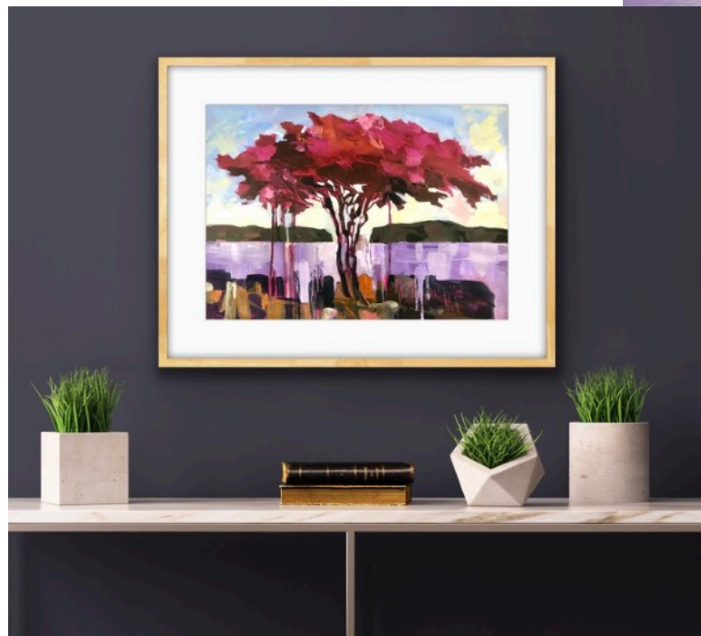
As Summer Ends Acrylic on paper 64 x 80cms $1,400