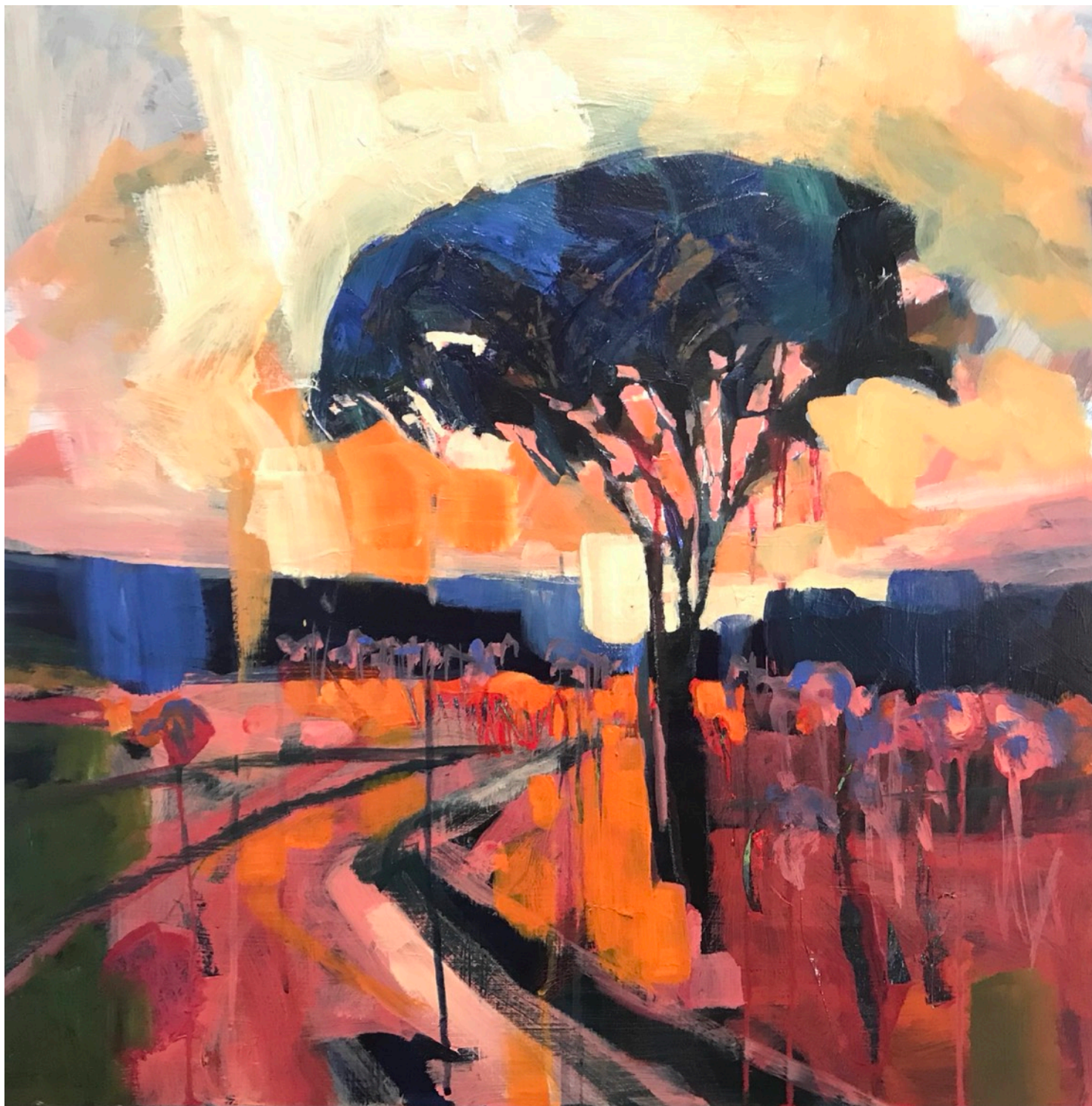
Like A Memory Acrylic on board 63 x 63cms $2,250