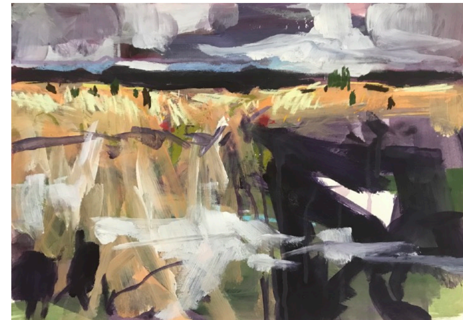
Drift In The Breeze Acrylic on paper 50 x 60cms $850