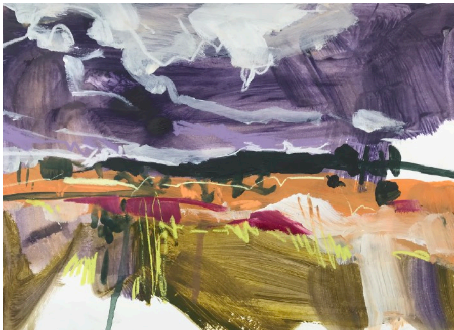
Dancing Wind Acrylic on paper 50 x 60cms $850