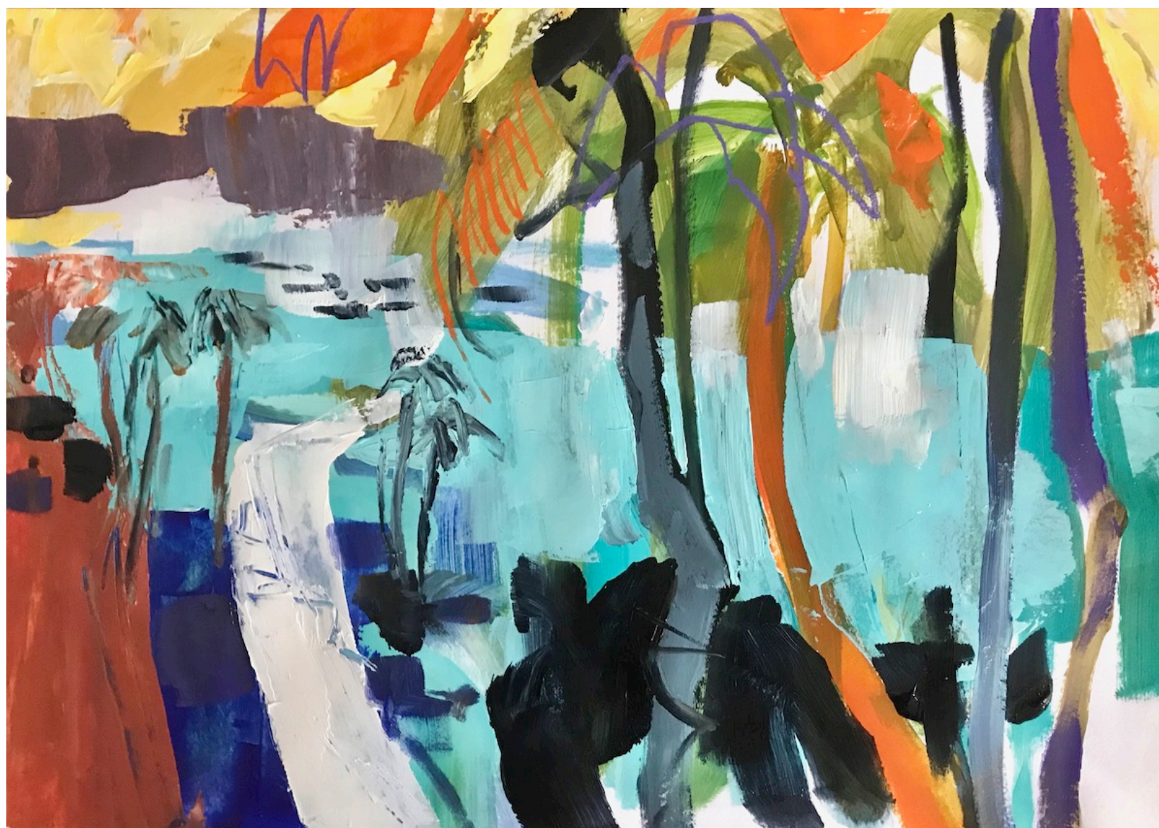
Upon a painted bay Acrylic on paper 48 x 58cms $625