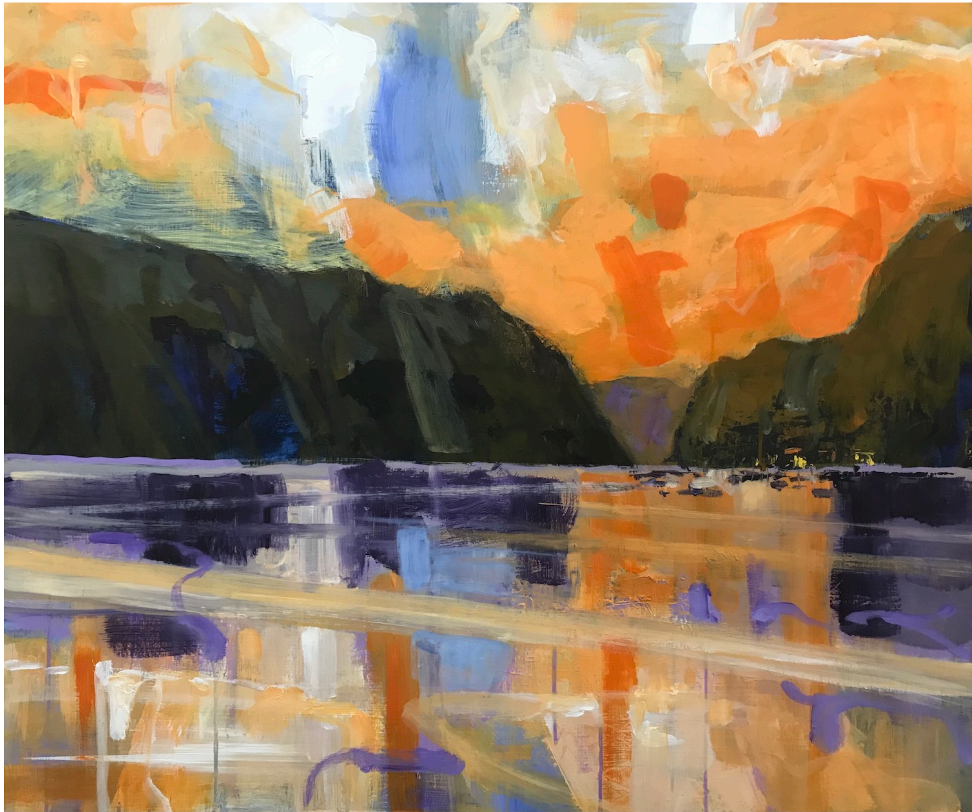
Safe Harbour Acrylic on board 78 x 93cms $2,950