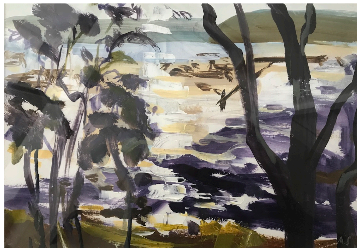
Dance across a glassy surface