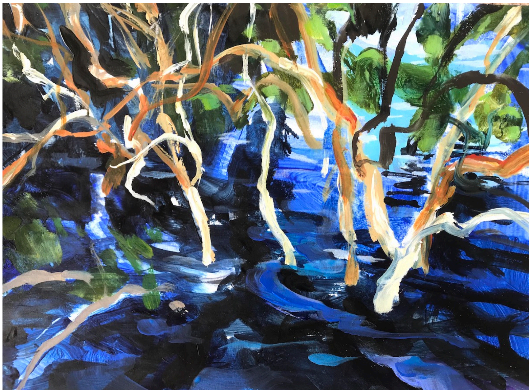
Still waters Acrylic on paper 48 x 58cms $625