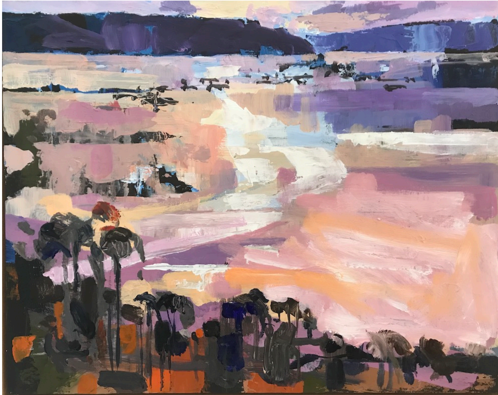
Pink reflections Acrylic on board 43 x 53cms $1,200