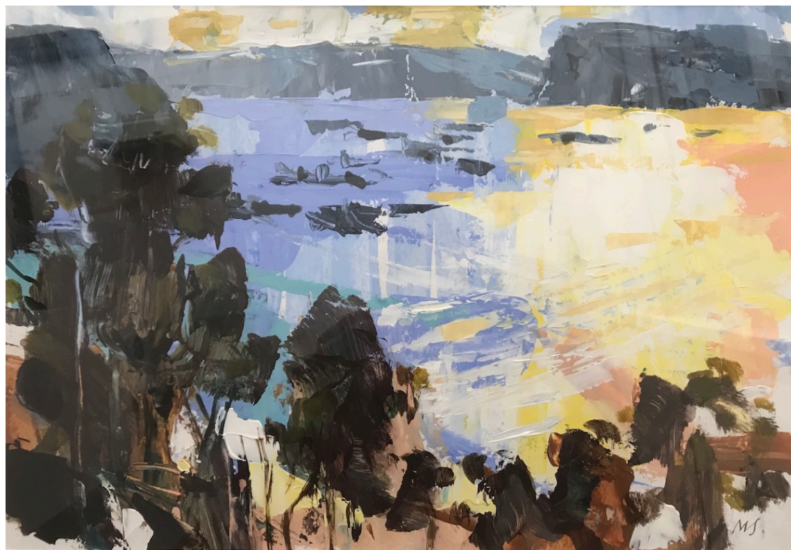
Whispers on the water