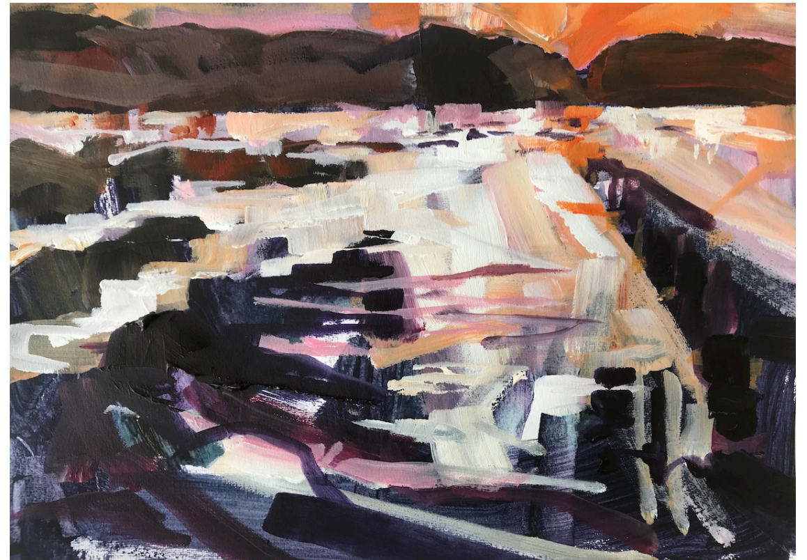
An evening falls