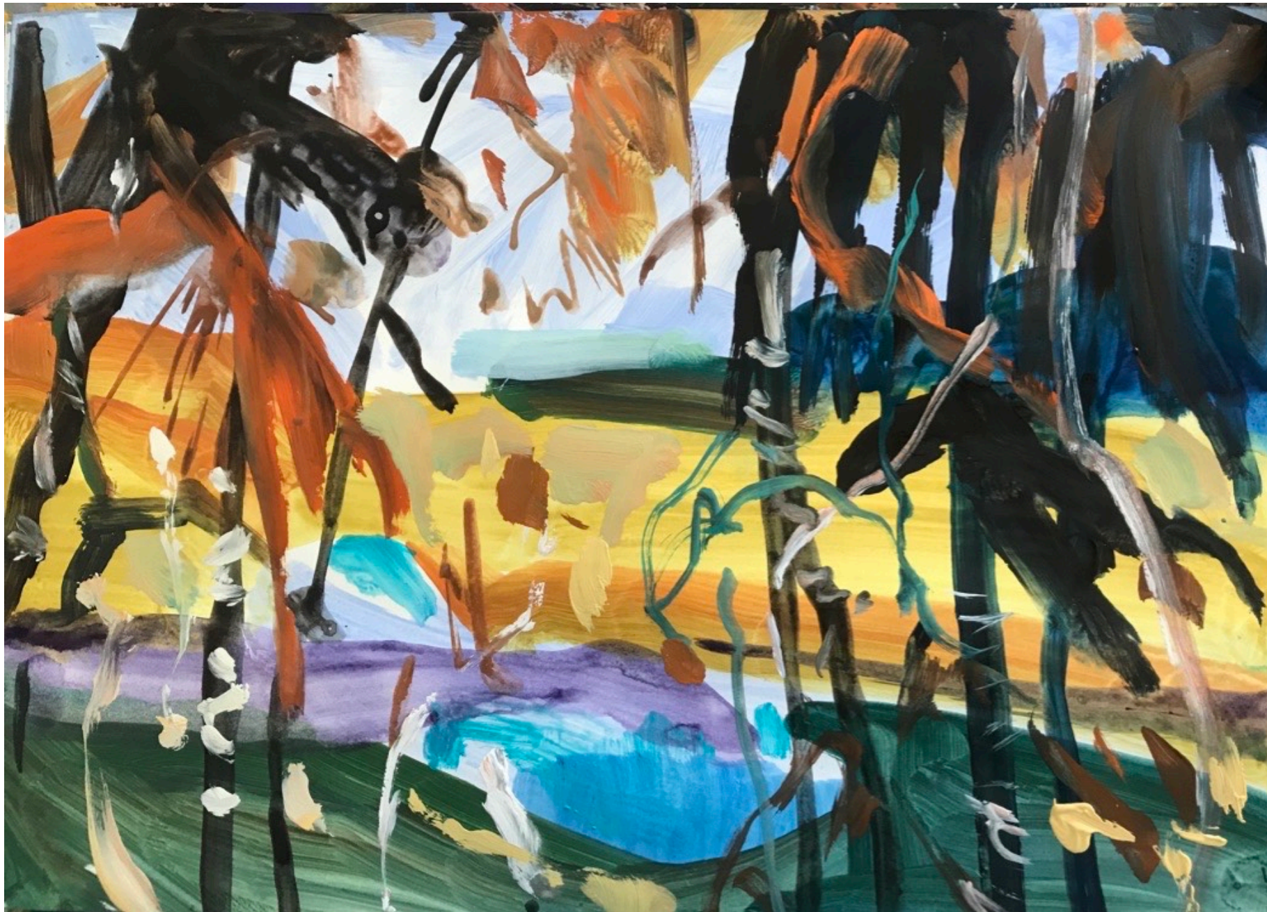
The Road to Ned's Beach Acrylic on paper 50 x 62 cms $650