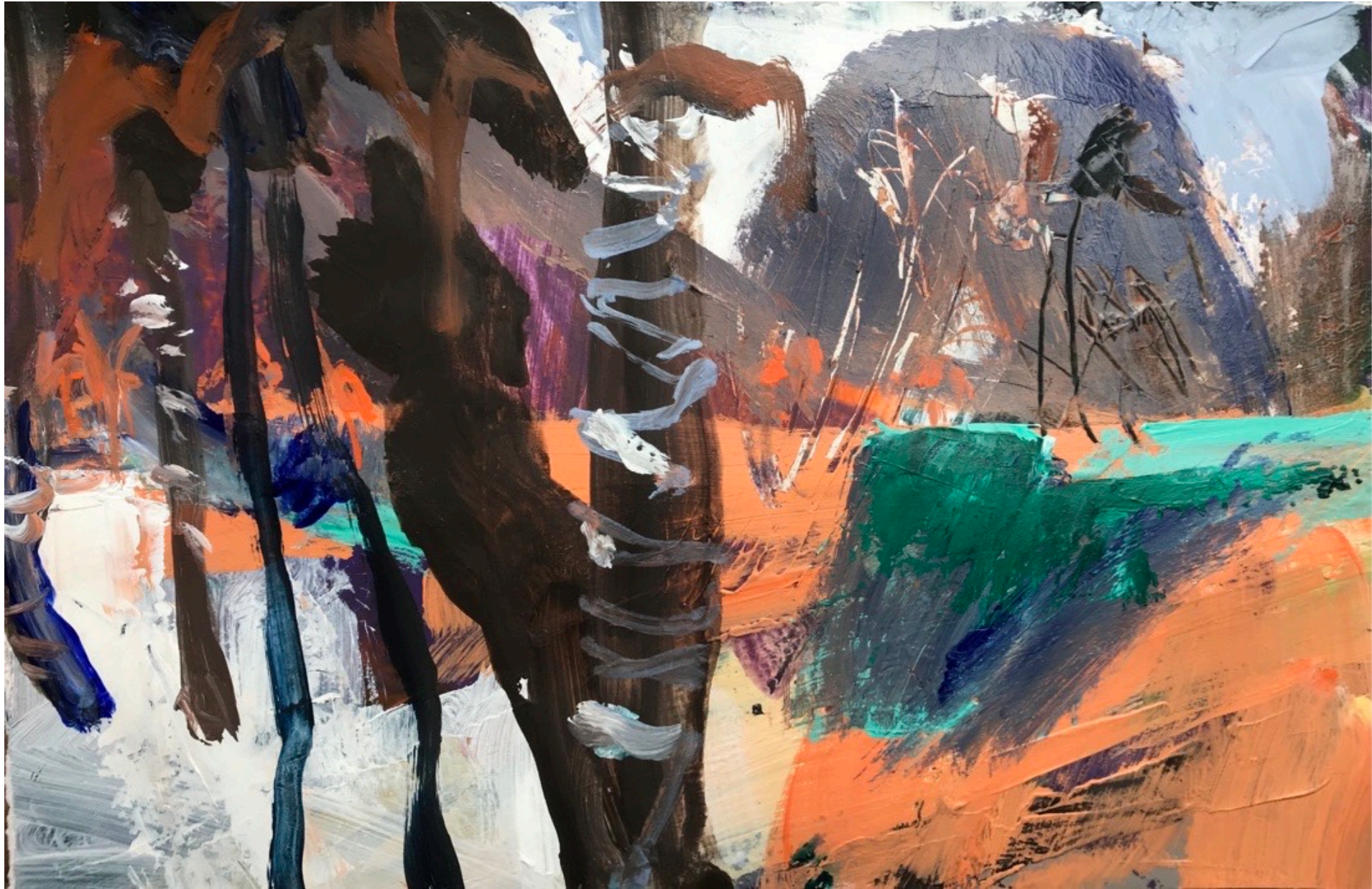
Windswept Acrylic on paper 43 x 55 cms $590