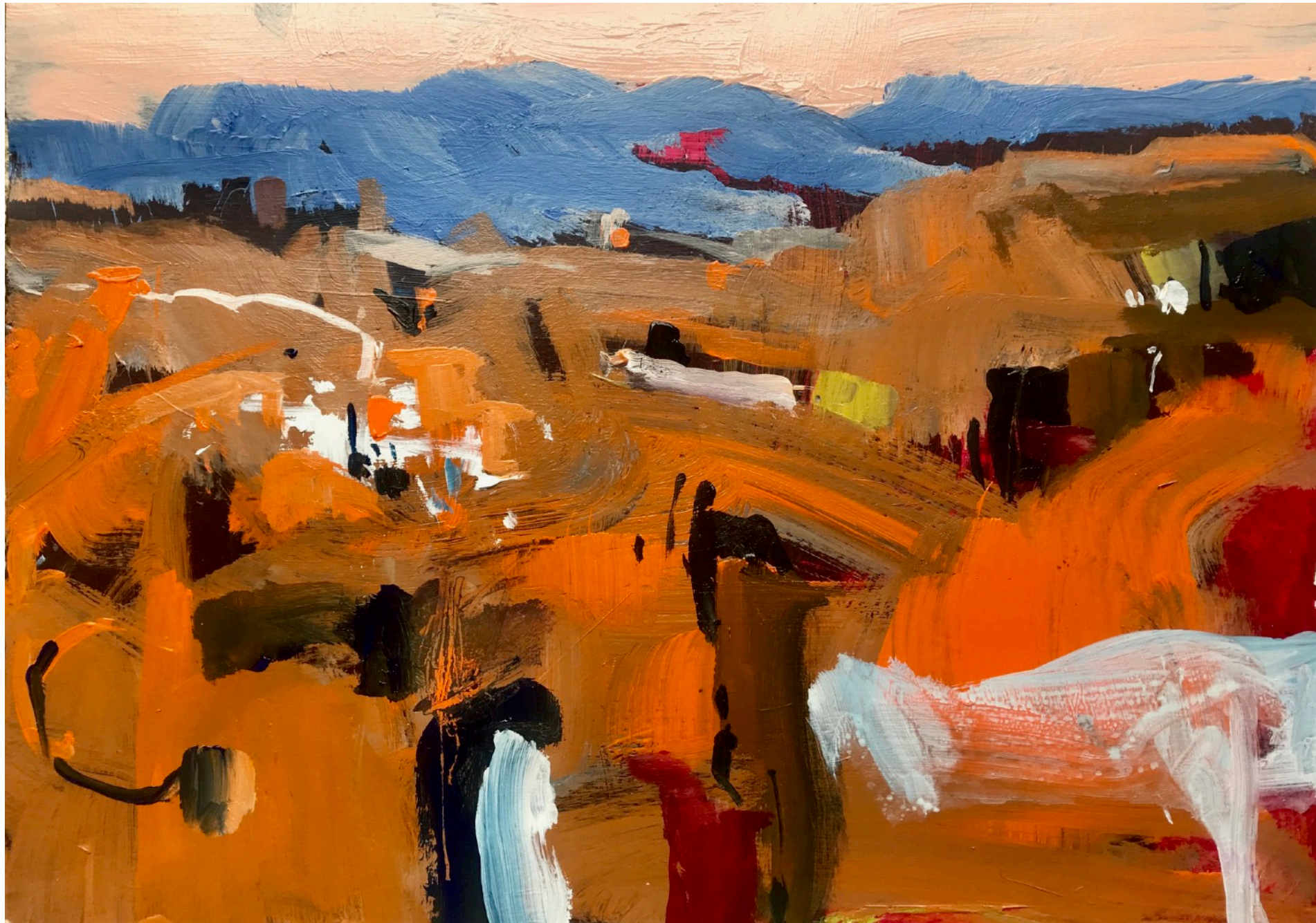
The Last Hour of Daylight