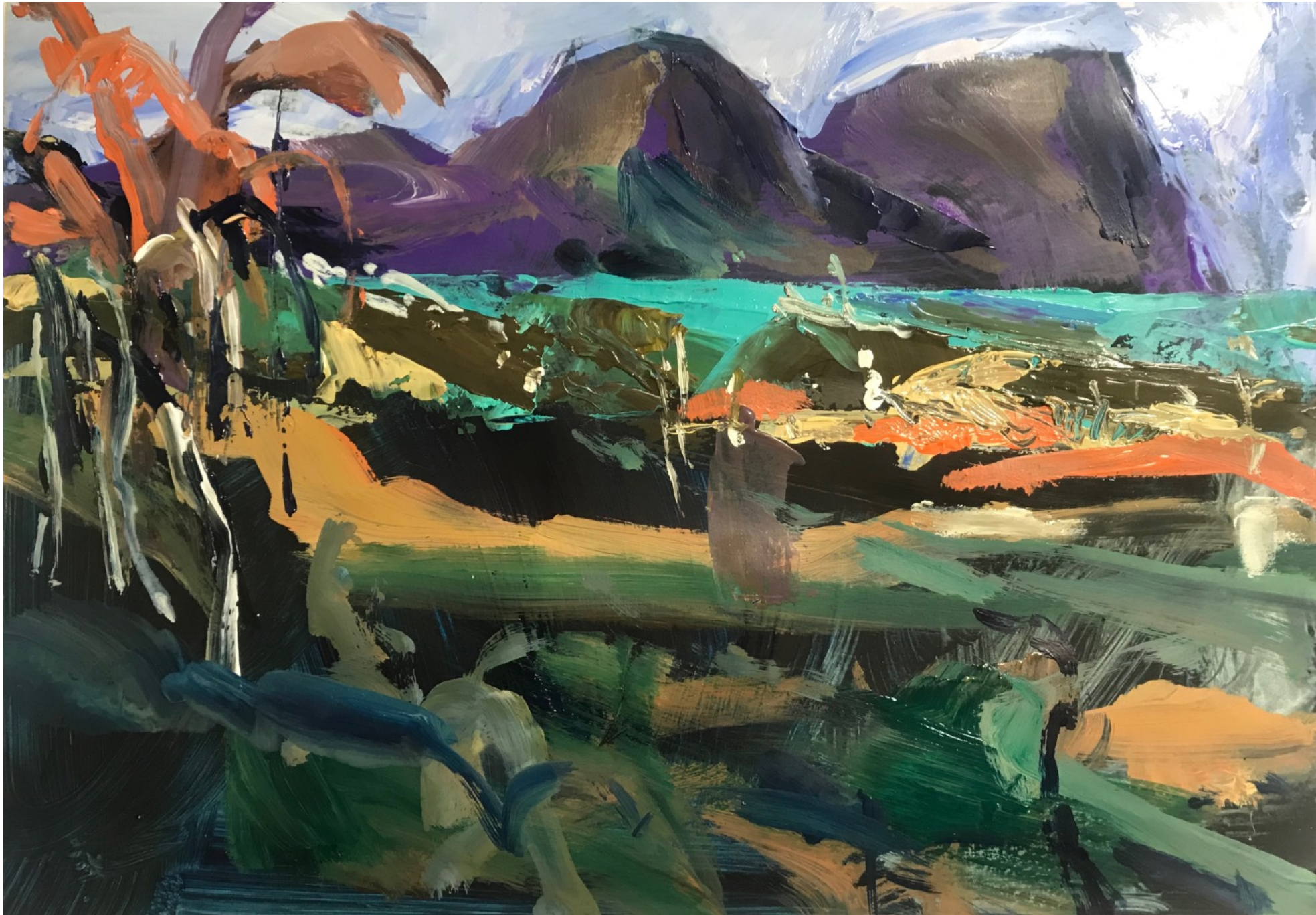
Distant Peaks Acrylic on paper 50 x 62 cms $650