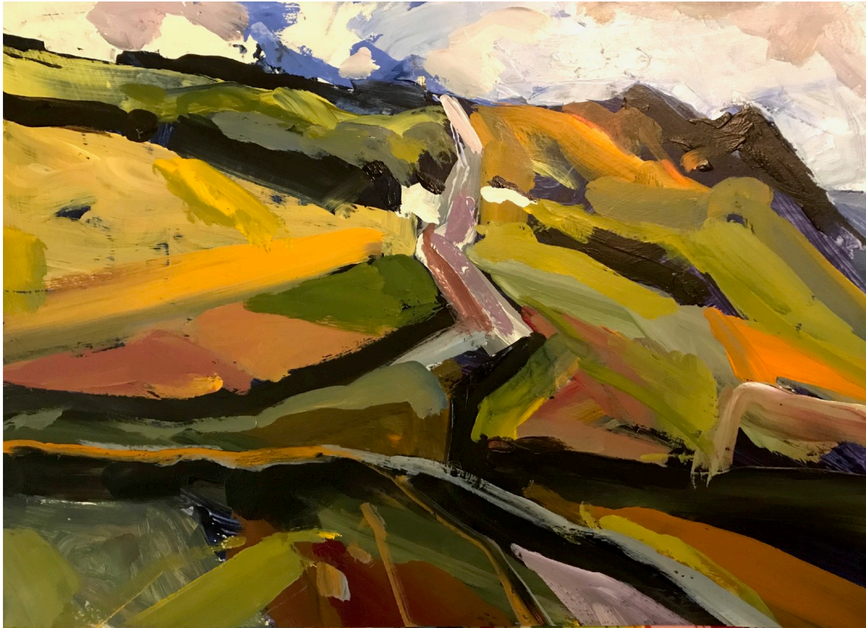
The Last Headland Acrylic on paper 50 x 62 cms $650