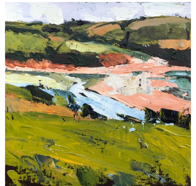
Tidal Estuary Acrylic on board 30 x 30 cms $700