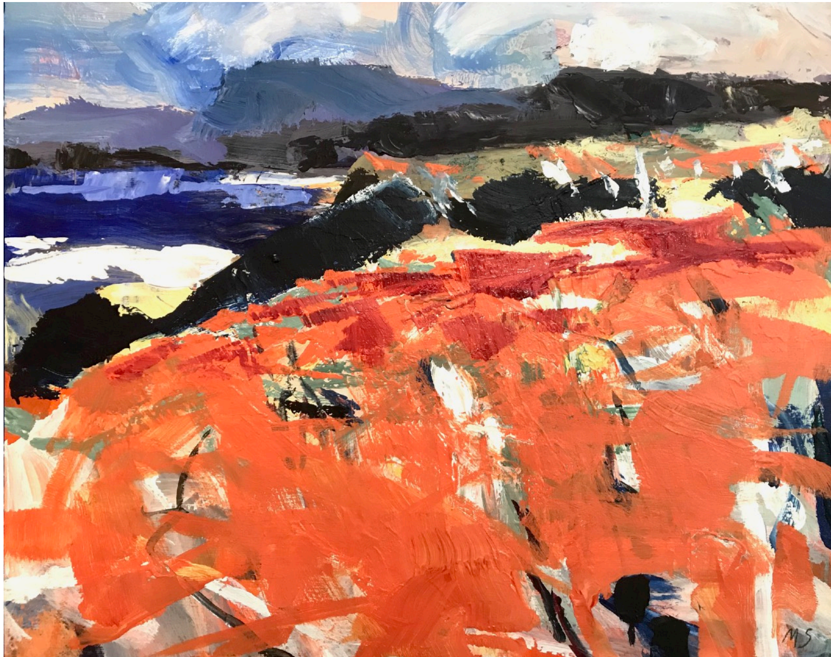
Serrated Shore 42 x 52 cms Acrylic on board $1100