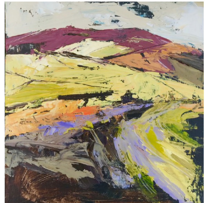
Mist over the Moorlands Acrylic on board 30 x 30 cms $700