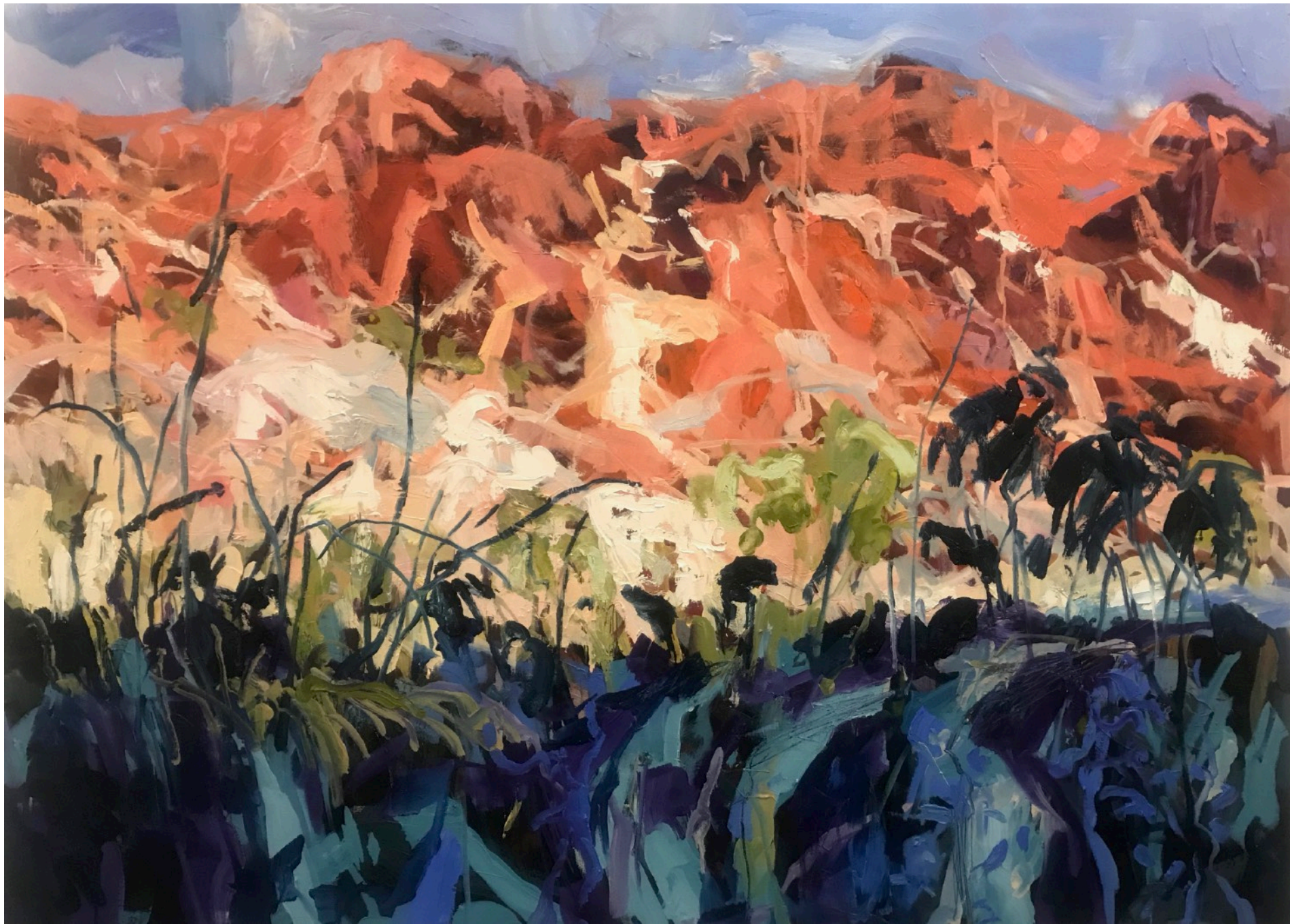
N'Dhala Gorge Oil on Canvas 121 x 167 cms $4,800