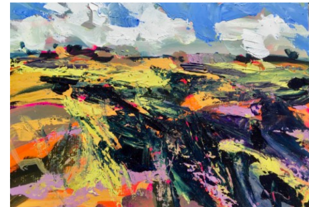
Windy Moorland Acrylic on paper 23 x 35 cms $400