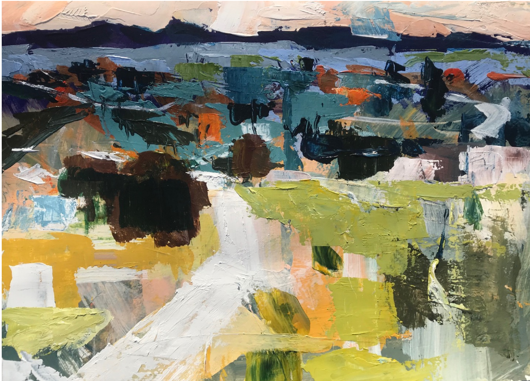
The White Roads Acrylic on paper 50 x 62 cms $650