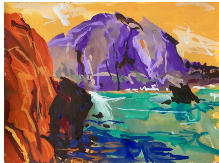
The Rock Gouache on paper 30 x 42 cms $400