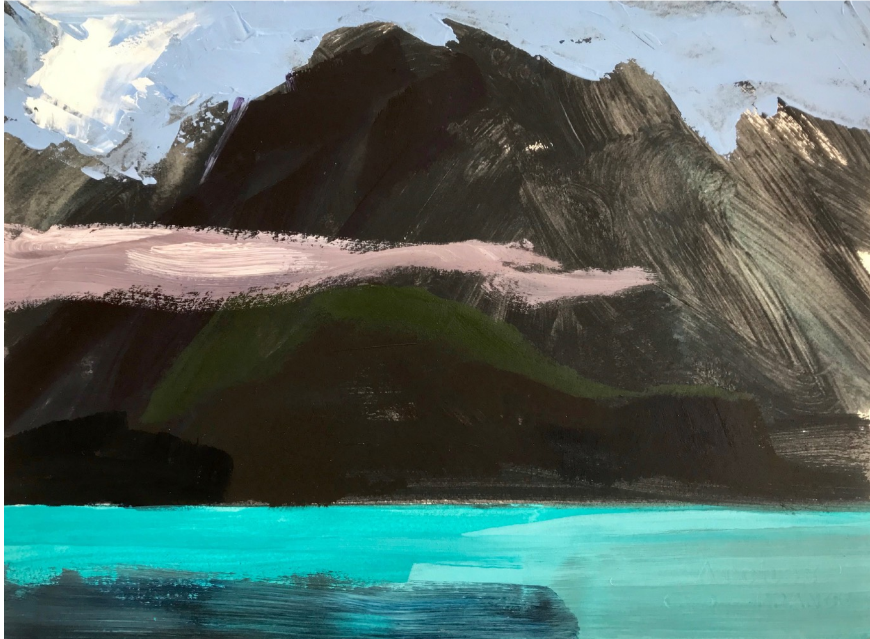
Milford Sound Acrylic on paper 50 x 58 cms $600