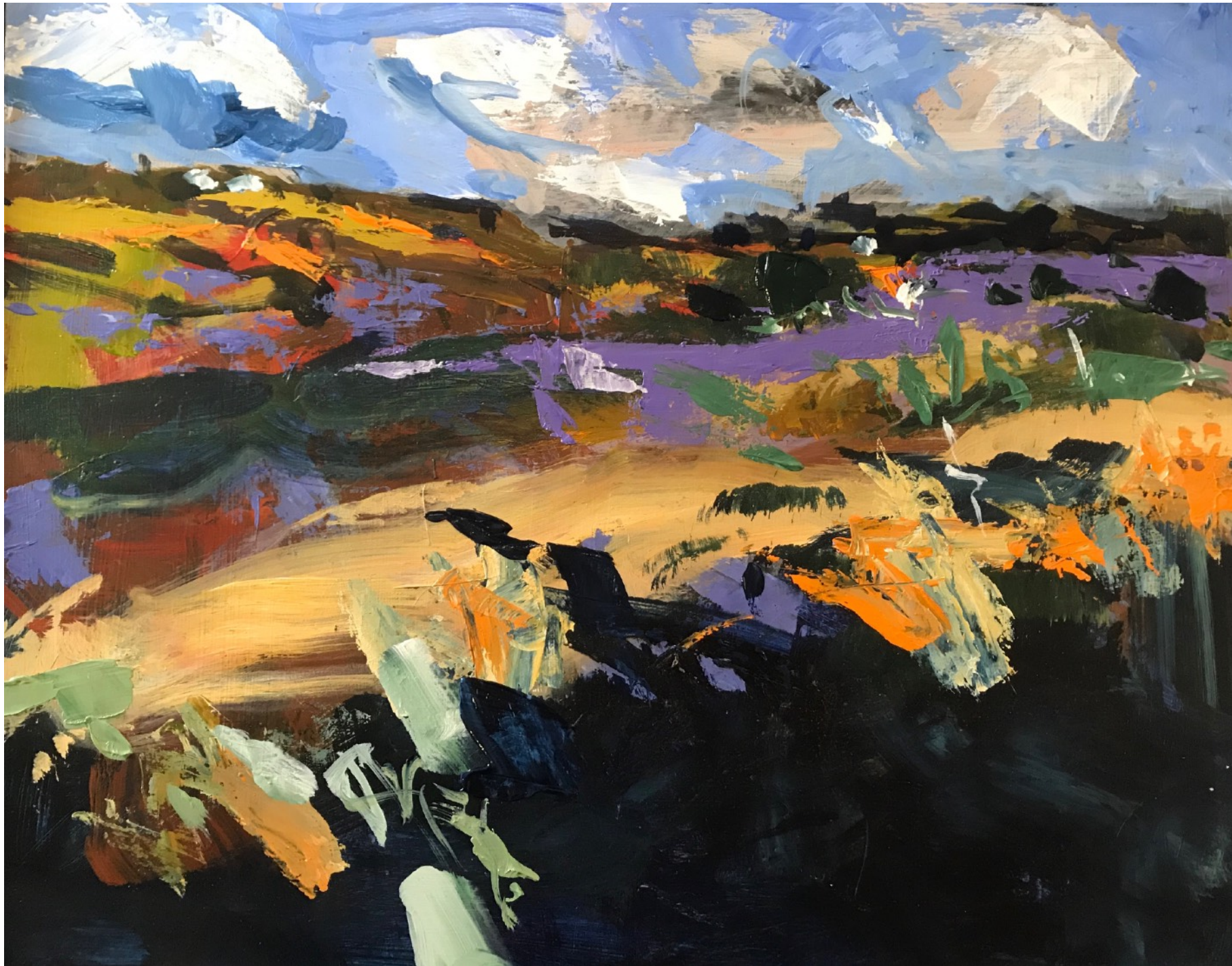
Song of the Wind Acrylic on board 40 x 50 cms $1100