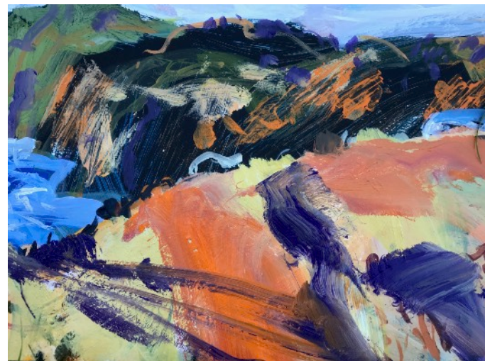
Where the Coast Meets the Sea Acrylic on paper 30 x 42 cms $400