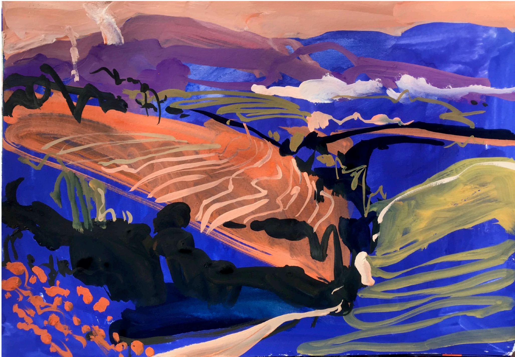
Amongst the Vineyards Gouache on paper 50 x 62 cms $650