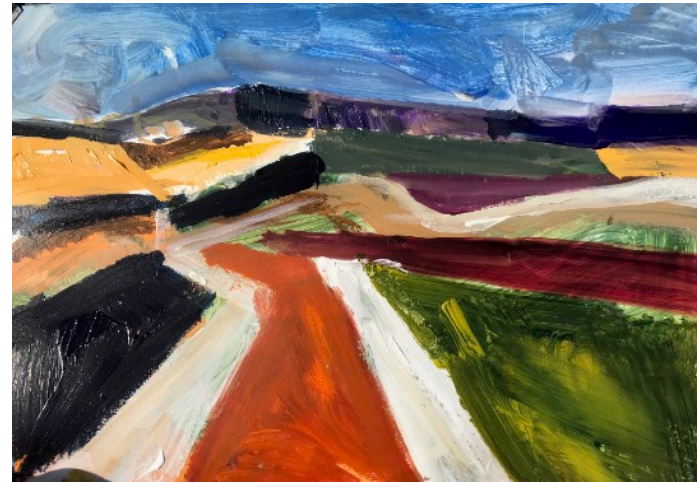
Pathways to the Headland Acrylic on paper 30 x 42 cms $400