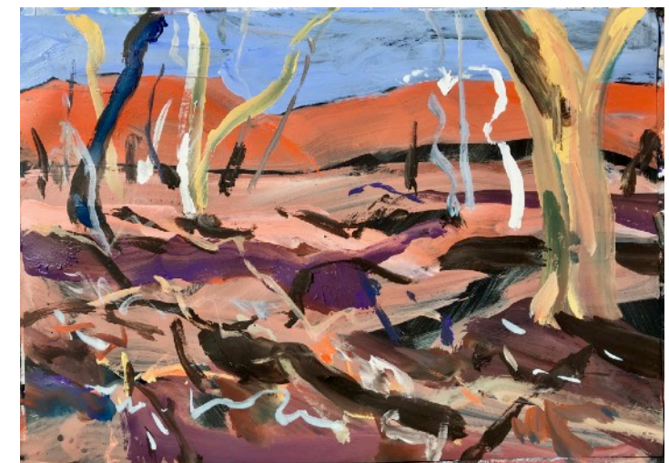
Love's Creek Gouache on paper 30 x 42 cms $400

All enquires to mikestaniford@icloud.com