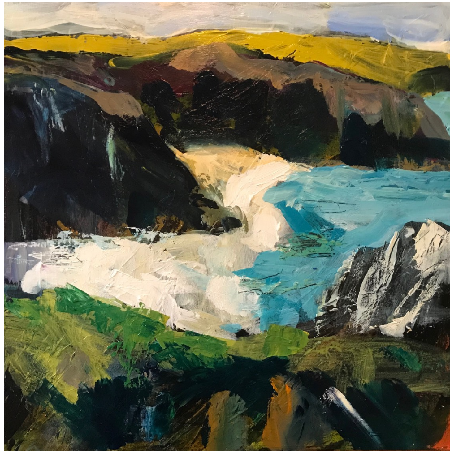
Secluded Cove Acrylic on board 40 x 40 cms $985