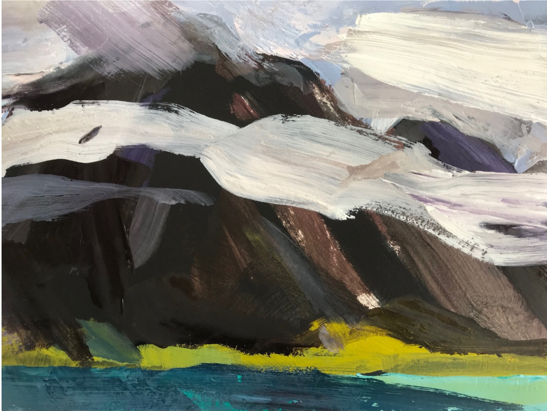
Lake Teanau Acrylic on paper 50 x 58 cms $600