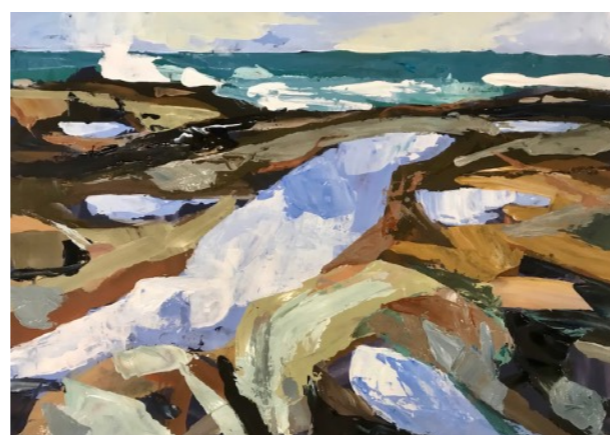
Pools of Light Acrylic on paper 30 x 42 cms $400