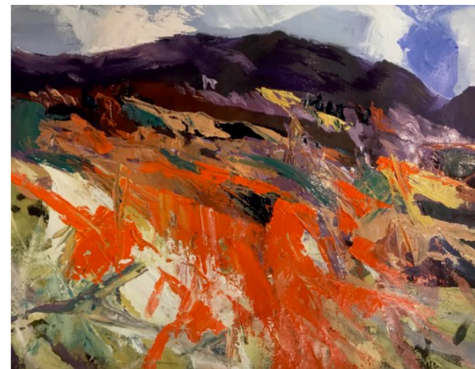
Fire in the Leaves Acrylic on paper 61 x 72 cms $950