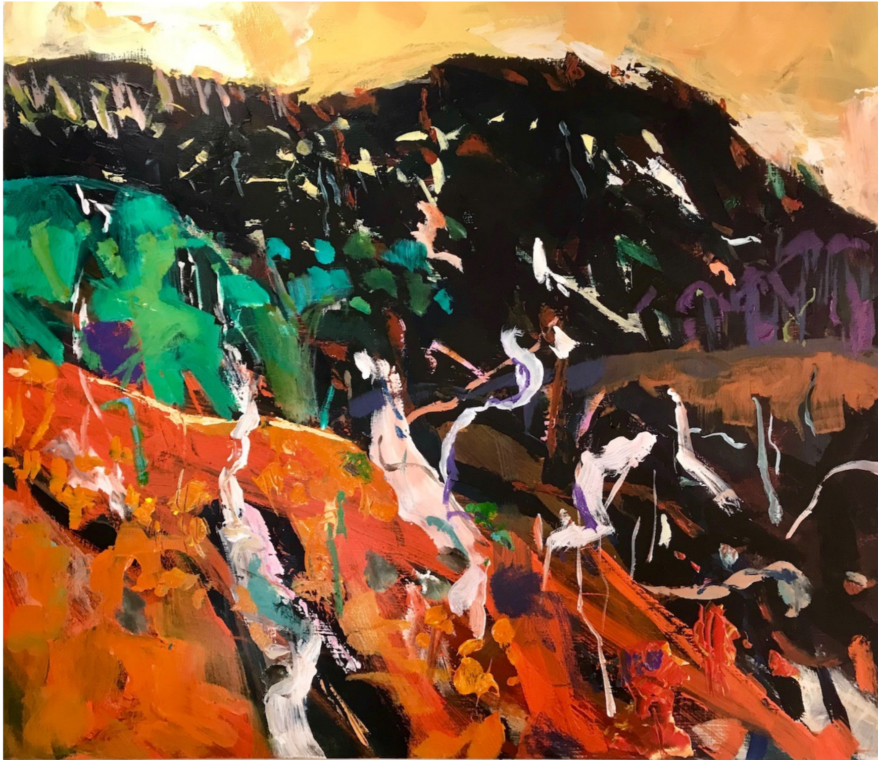
Evening Promontory Acrylic on board 60 x 70 cms $1,400