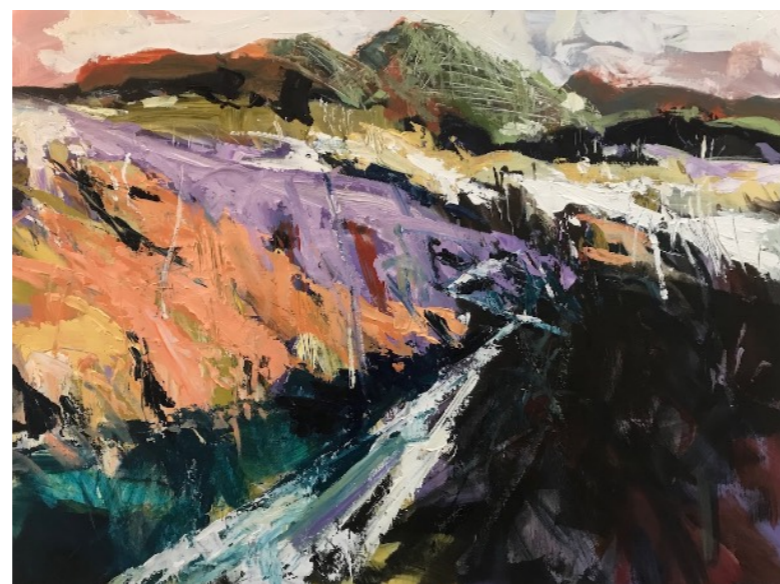
Deep Seclusion Acrylic on board 91 x 122 cms $2,600