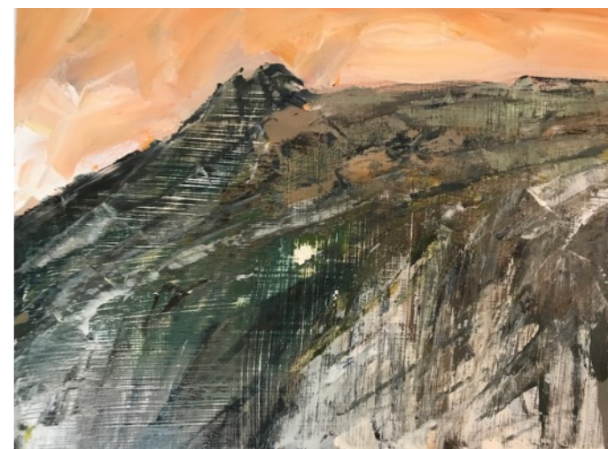
Cold Earth Sleeping Acrylic on board 210 x 295cms $650