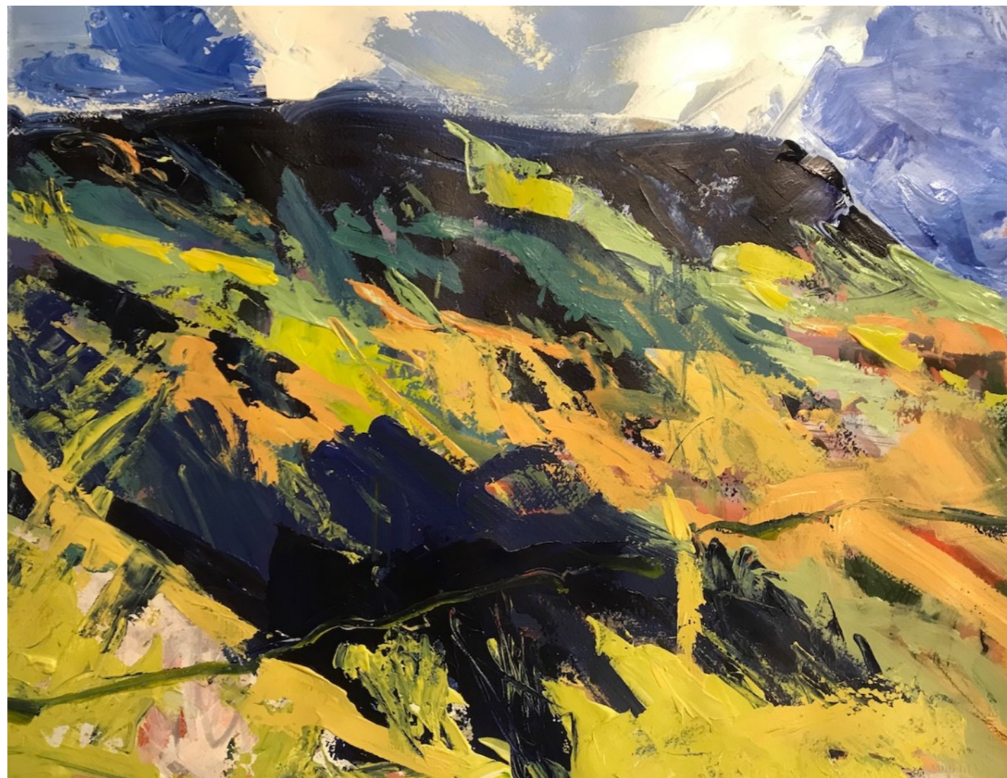
Open Horizon Acrylic on paper 62 x 67 cms $950