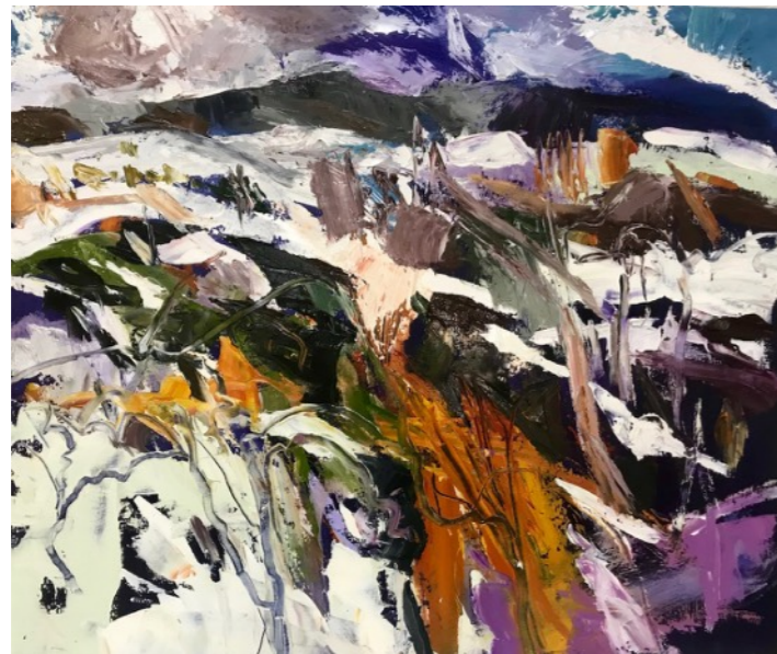
Arrives the Snow Oil on board 60 x 70 cms $1,400