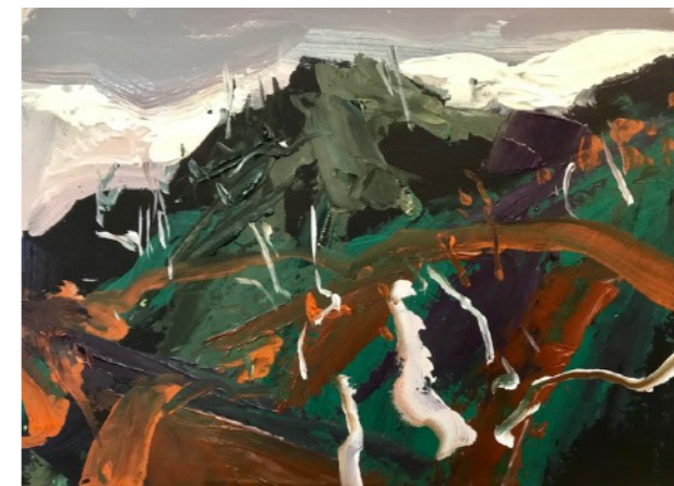
Killcare Trail Acrylic on paper 30 x 42 cms $400