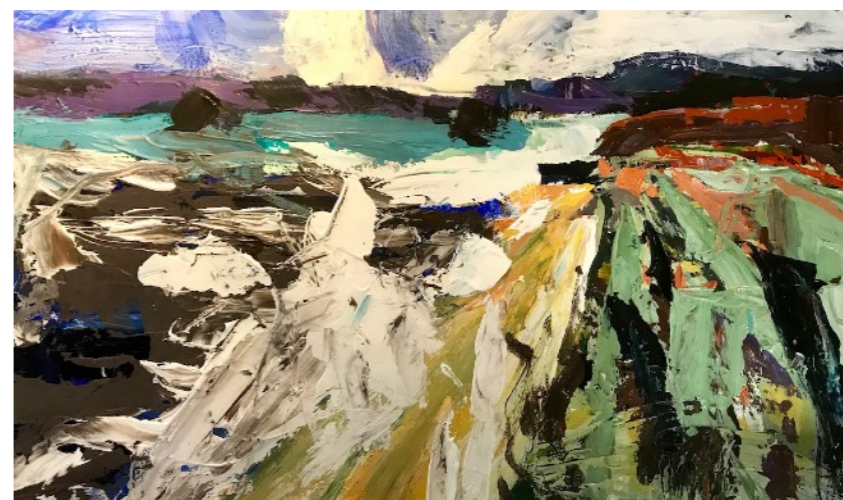
Dancing Waves Acrylic on paper 62 x 80 cms $950