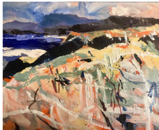
Serrated Shore 42 x 52 cms Acrylic on board $950