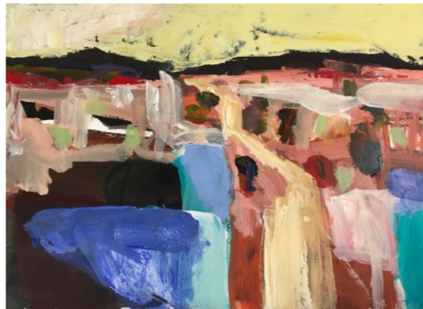
Aurora Acrylic on paper 30 x 42 cms $400