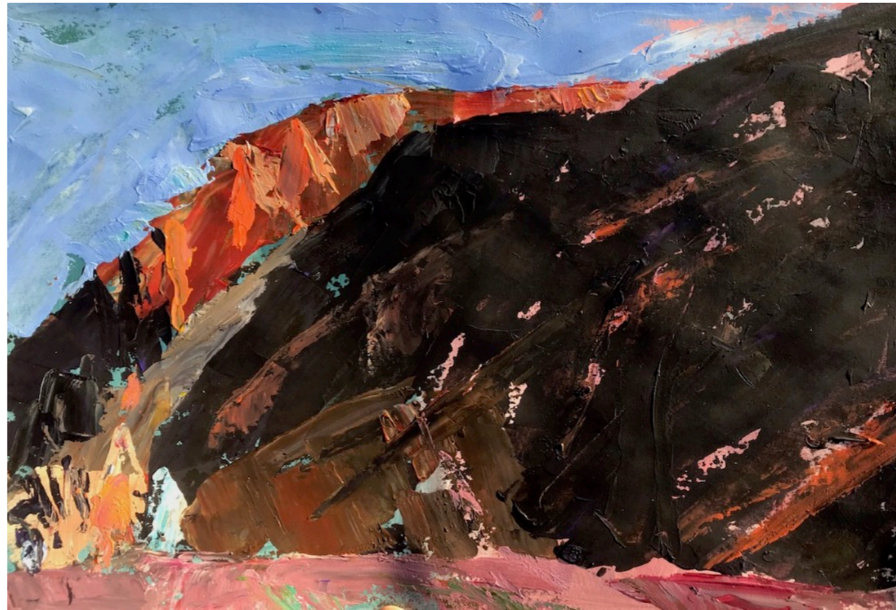
Emerging Glow Acrylic on paper 50 x 62 cms $850