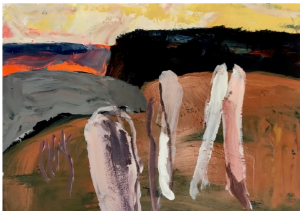
Box Head 2 Acrylic on paper 30 x 42 cms $400