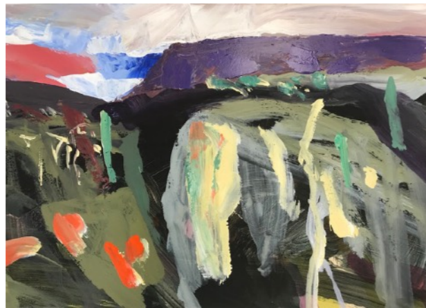
Box Head 1 Acrylic on paper 30 x 42 cms $400