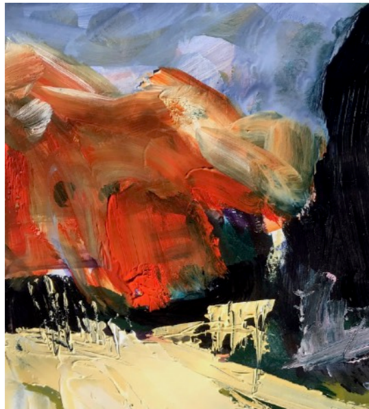
Love's Creek 1 Acrylic on paper 50 x 42 cms $550