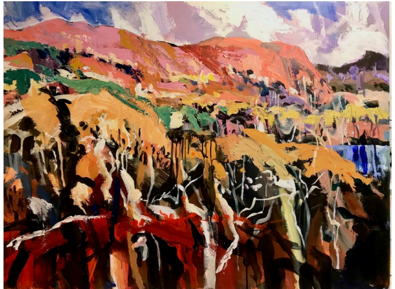
Immersed in Nature Acrylic on board 91 x 122 cms $2,600