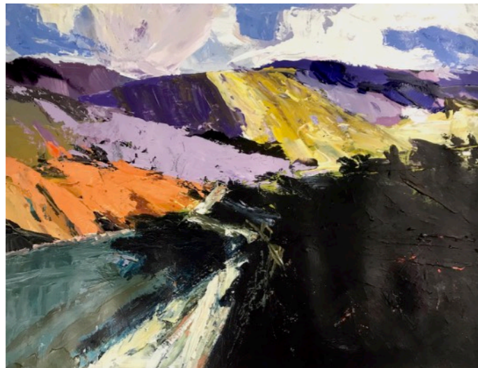
Kingdom of Shadows Acrylic on paper 61 x 72 cms $950