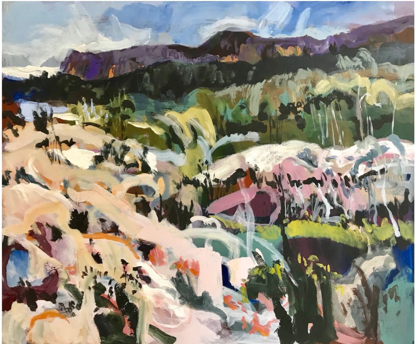
Towards Broken Bay Acrylic on board 120 x 124 cms $3,200