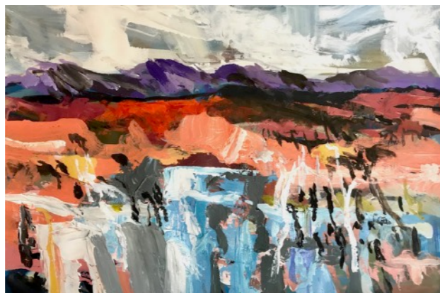
Filled with Expectation Acrylic on paper 58 x 77 cms $950