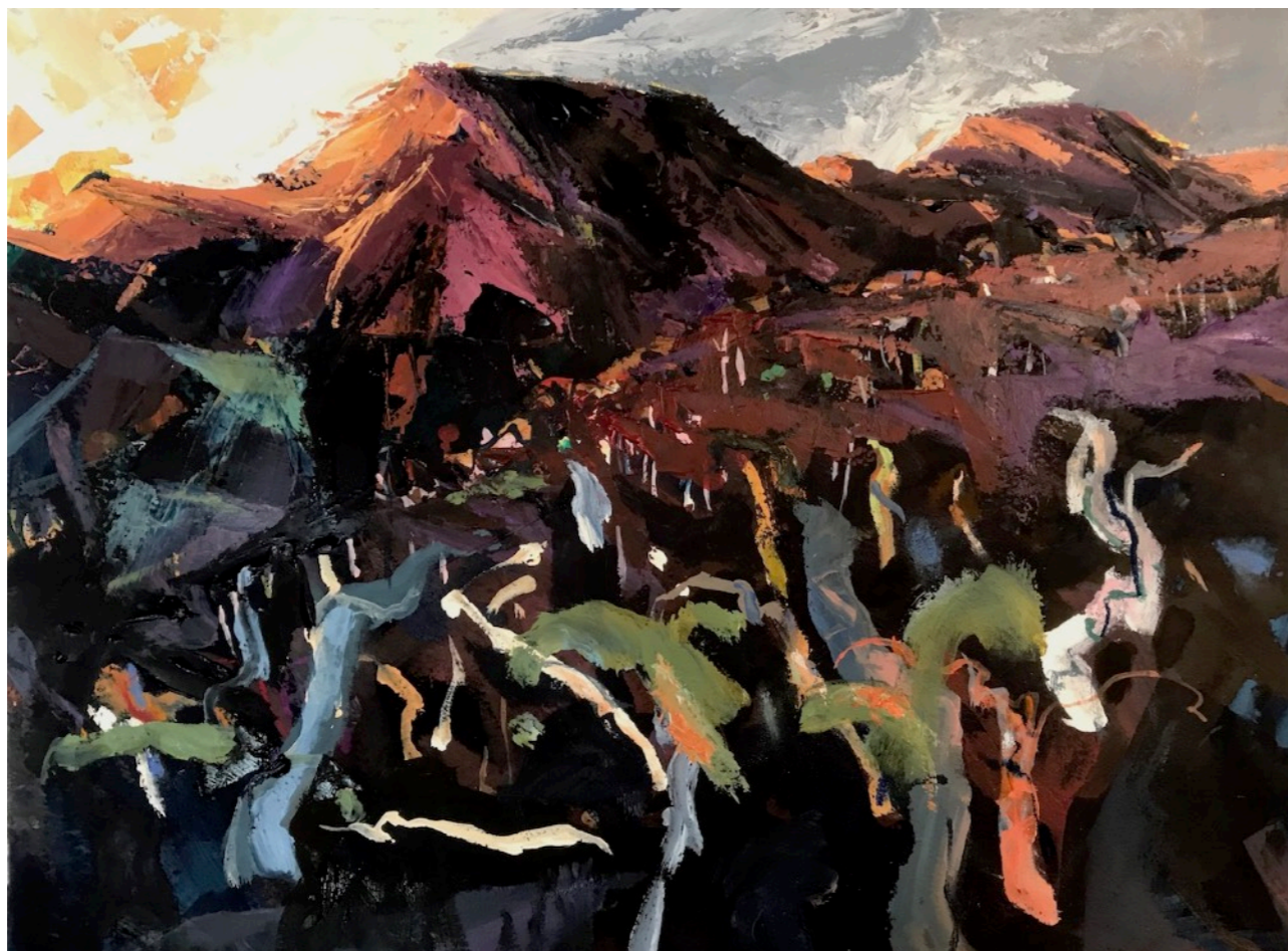
Beneath the Mountain's Gaze Acrylic on paper 77 x 97 cms $1,300