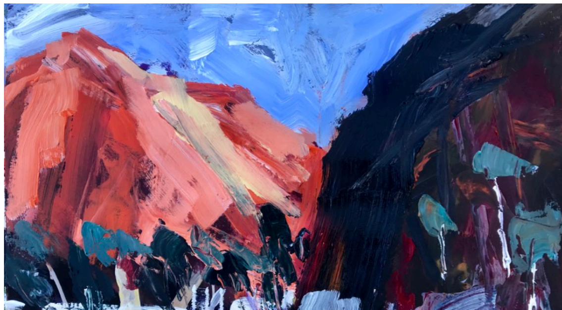
Love's Creek 2 Acrylic on paper 45 x 62 cms $650