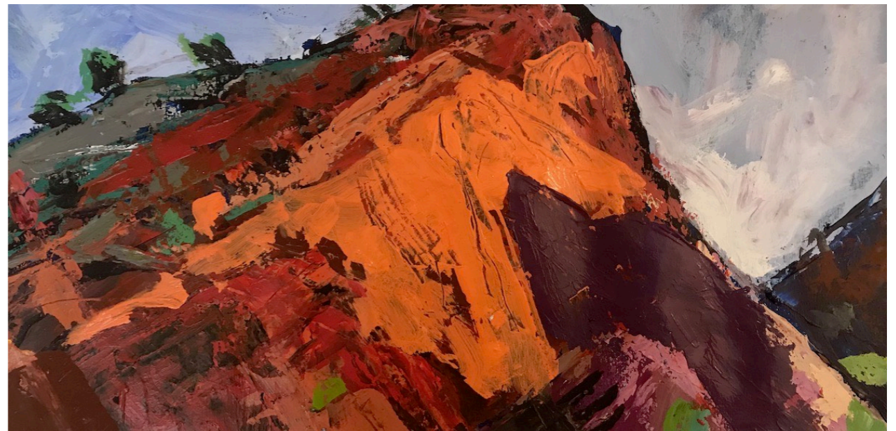
Broken Light Acrylic on paper 40 x 61 cms $850