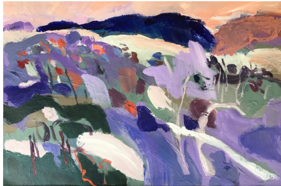
Land of the Free Spirit 3 Acrylic on paper 59 x 77 cms $950