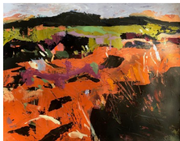
Summer has Passed Acrylic on paper 61 x 72 cms $950